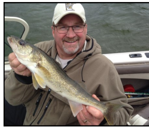
A spring of 2018 Bemidji area walleye. Thank you Bemidji area committee!

I think most of us find that music can tell a story, that is why we listen and enjoy it. A recently released country music song from Luke Bryan has a line that resonated with me... "Days go slow and years go fast". As the ED, part of my duties are to complete a fair amount of administrative duties and sometimes it tends to make the days go slow. But, I feel as though the past 3 years have gone by very quickly for me. I reflect on the operational changes, programs that have been refined, and most of all the relationships that I have developed. Your board of directors continues to guide the organization, are great to work with, and I am pleased to be able to call them friends. As the sole "employee" of the organization, sometimes things can get a bit overwhelming for me. Talking with board