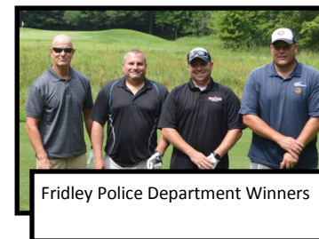
Fridley Police Department Winners